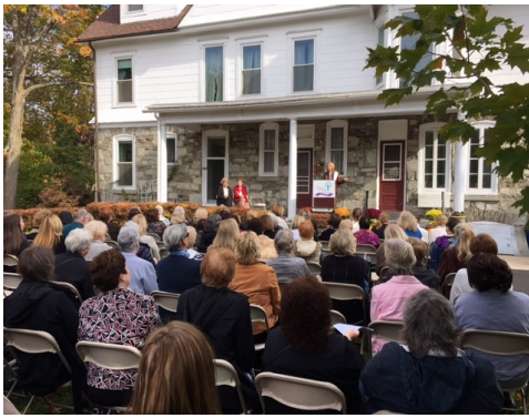
More than 100 guest attended the event on October 29, 2016

At a morning panel discussion, a distinguished group of professionals shared their thoughts on the topic of “Women and Social Responsibility.”