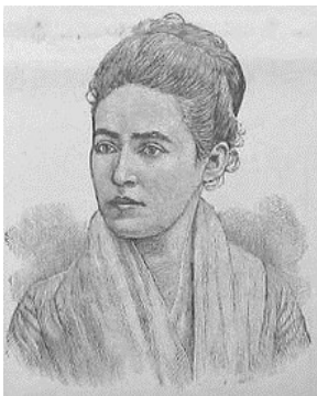
Minerva Parker Nichols

As the first woman in the country to practice architecture independently, Minerva Parker Nichols (1860-1949) carved out a prominent place in the male-dominated field of architecture by specializing in projects for mostly female clients and their needs. One of those projects was Mill-Rae, the stately and historically important Victorian home that sits on Cranaleith's property in Northeast Philadelphia.