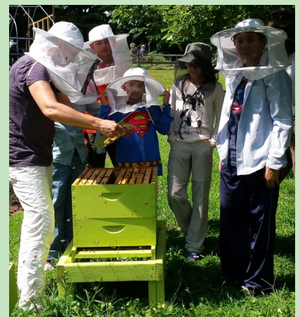
Volunteers helping with beehives